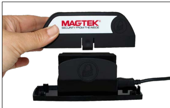
Figure 2. Picture of MagTek eDynamo mobile device being placed into stationary case