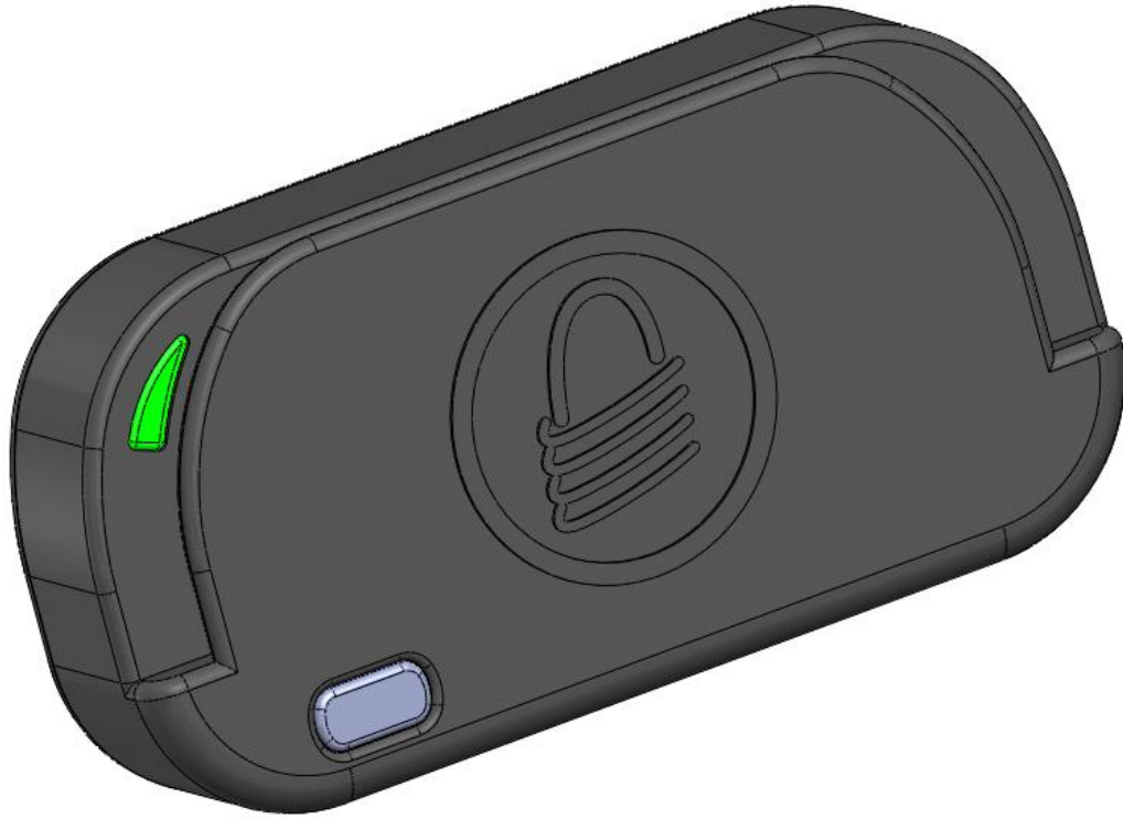
Figure 1-1. Flash MagneSafe Reader