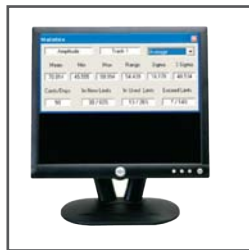
Statistical Data can be displayed on any histogram or control chart in the summary reports