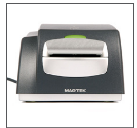
The IntelliStripe 380 is a motorized magstripe/Smart Card encoder-reader that instantly encodes magstripe cards