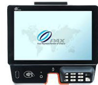
Pax Aries 8