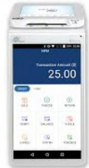
Pax E600 mini