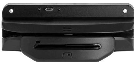
Over head view unattached

To make things even easier, MagTek offers MagneFlex Prism developer tools. MagneFlex Prism is a suite of interface developer tools that reduce the points of development. Instead of using SDKs, APIs, and applets to build an interface to the hardware device, another to interface to the POS application, and another to the gateway, you can build the interface to just MagneFlex. MagneFlex drives the hardware, interfaces with the POS app, and can issue the commands to pack, parse and send the data out for processing.