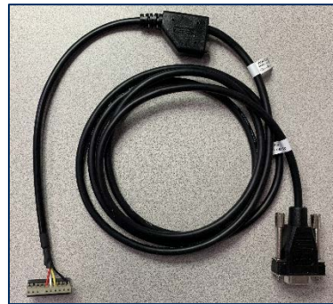
Power Only Cable 1000003906 (LEFT), RS-232 / Power Cable 1000004111 (RIGHT)