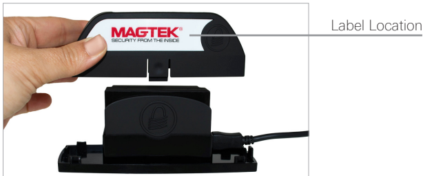
Figure 1. eDynamo reader being placed in optional docking station