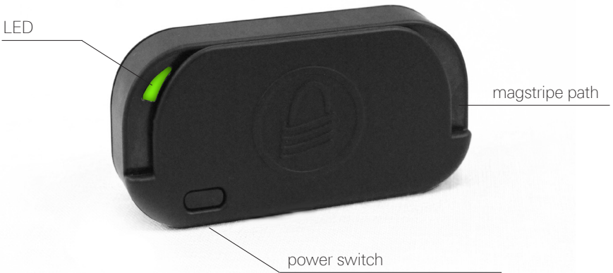
Figure 1. Contents