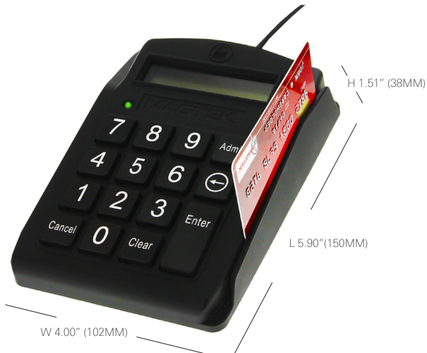
Figure 2. Dimensions