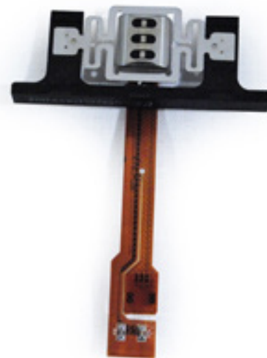
MagneSafe IntelliHead Accordion Spring U-bracket USB Connection (UART, SPI not pictured)

MagneSafe IntelliHead is security built into MagTek's line of Secure Card Reader Authenticators (SCRAs). MagneSafe SCRAs deliver dynamic card authentication, data encryption, tokenization, and device/host authentication to protect cardholders from identity theft and card fraud. MagneSafe SCRAs deliver a variety of configuration choices with unmatched reliability and first swipe read rates. Integrate MagTek components and devices into your solution easily with APIs, software developer kits and MagTek support services.