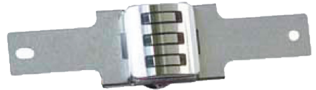
MagneSafe IntelliHead Butterfly Spring USB, SPI, UART connections available

MagneSafe readers can be configured to authenticate a host before sending the encrypted card data. This type of authentication requires a mutual handshake between the MagneSafe reader and the host, eliminating the threat of being re-directed to an illegitimate host. Furthermore, the device itself can be authenticated so the host may know it is a valid reader-authenticator.