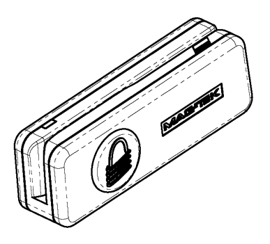
Figure 1-1. Bluetooth MagneSafe Swipe Reader