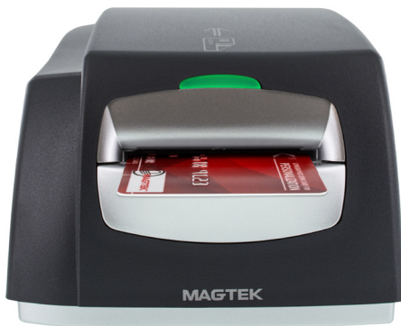
IntelliStripe 380 Motorized card encoder (magstripe, EMV)

Instantly issue cards to customers and guests. The IntelliStripe 380 Encoder (IS380) is a highly reliable motorized device that reads and encodes magnetic stripe and EMV smartcards with precision. Its compact footprint, rugged design, and low audible noise, make it a perfect choice for motorized card issuance at schools, businesses, retailers, and government environments.