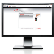
QwickCards Cloud-based software solution for instant issuance of cards