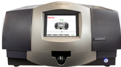
ExpressCard 3000 Card Personalization Device with magstripe/smart card personalization, embossing, printing, tipping, and indent printing

Your cards need to reflect your brand, whether it is a relaxing spa getaway, deluxe casino or corporate government offices. MagTek provides the hardware and software solutions to deliver cards instantly to your customers, guests, student body, or employees instantly and securely. MagTek solutions always deliver speed and efficiency with the most comprehensive security possible that is both flexible and scalable, meeting your needs today and into tomorrow. A more secure brand enhances user experience and builds customer loyalty.