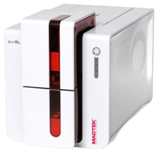
ExpressCard 500p Card Personalization Device with encoding and flat card printing